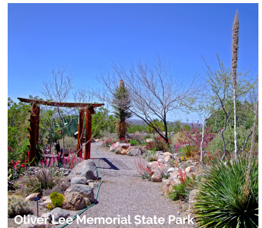
Oliver Lee Memorial State Park