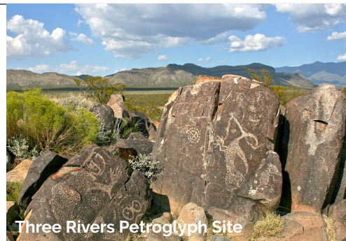
Three Rivers Petroglyph Site

☐ Start your morning at Three Rivers Petroglyph Site , located between Tularosa and Carrizozo on Highway 54. It is one of the few sites in the region that provides direct access to petroglyphs created by Jornada Mogollon people who used stone tools to create the art we now see on the rocks. Explore more than 21,000 glyphs depicting animals, humans, and nature.