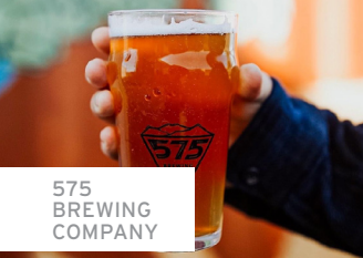
575 BREWING COMPANY