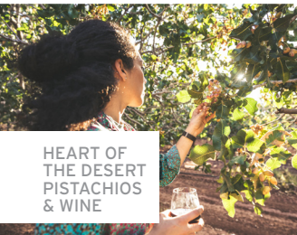
HEART OF THE DESERT PISTACHIOS & WINE

New Mexico has a long history of wine production, starting with the mission grape brought here by the Spanish Colonists. The fertile soil, high altitude and dry moderate weather make the Tularosa basin a perfect place to grow not only grapes but pistachios and pecans as well. You can explore numerous vineyards and nut farms, minutes from Alamogordo.