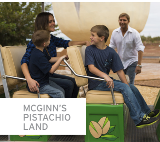
MCGINN'S PISTACHIO LAND